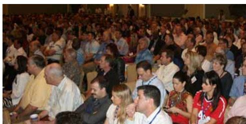
IQ - January 2011

the combined efforts of the various firms that make up the Association. Indeed, it is this spirit of cooperation amongst the insurance managers within IMAC that has helped build the Cayman Islands captive industry to what it is today. Please see the Forum Committee Report for more details. Planning for the 2011 Forum is about to begin and we look forward to seeing you there.