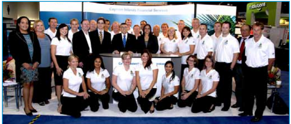
Cayman Islands representatives at ASHRM in Tampa, Florida in October 2010