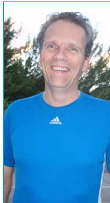
A notable athlete Governor Duncan Taylor