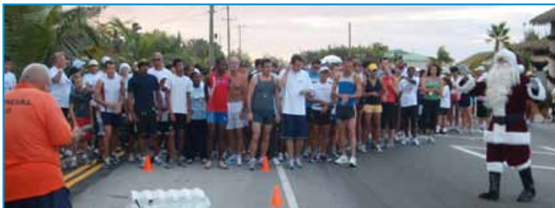
10 seconds before the gun

Additional photos of the Jingle Bell Walk/Run, and many of its very healthy competitors, are available at CaymanActive.com (at Search Box at right side, type Jingle Bell Run.)